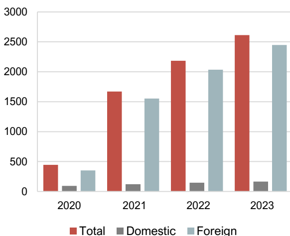
Graph 1 Tourists arrivals, in thous.