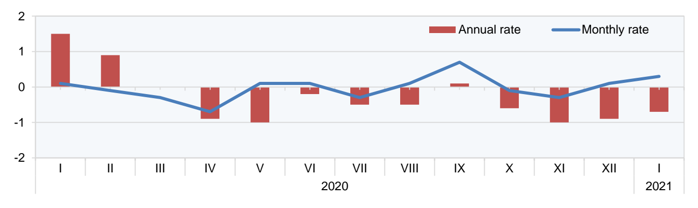
Chart 1. Annual and monthly rates of inflation (CPI), in %

Prices of other products and services mostly remained unchanged.