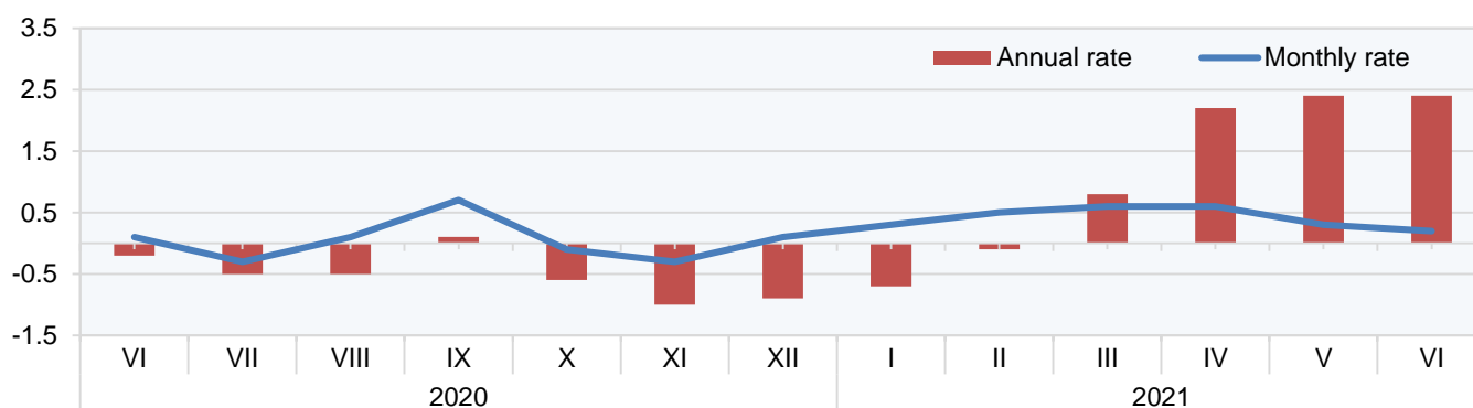
Table 1. Inflation rate measured by Consumer price indices (CPI)