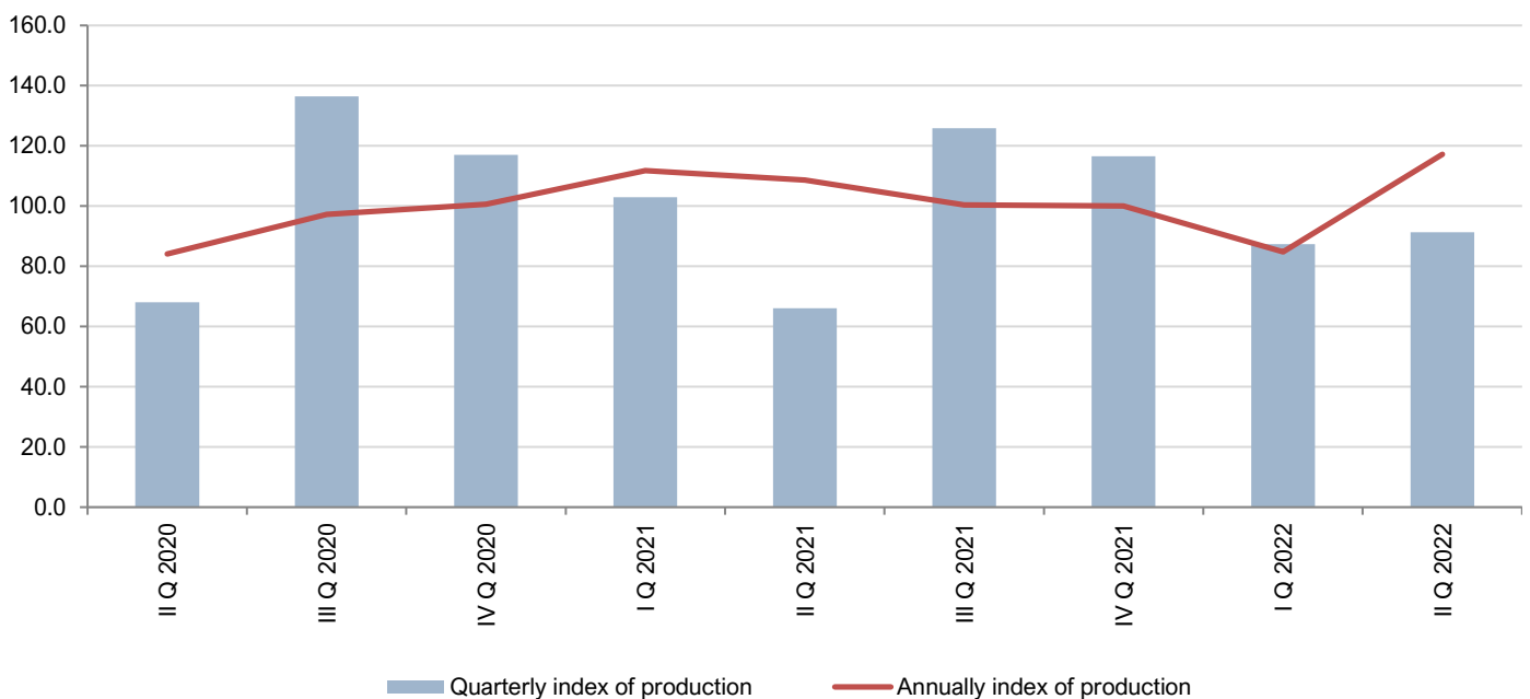
Graph 1. Quarterly and annually indices of industrial production

❖ Quarterly index of production – change in production in a current quarter compared with the previous quarter