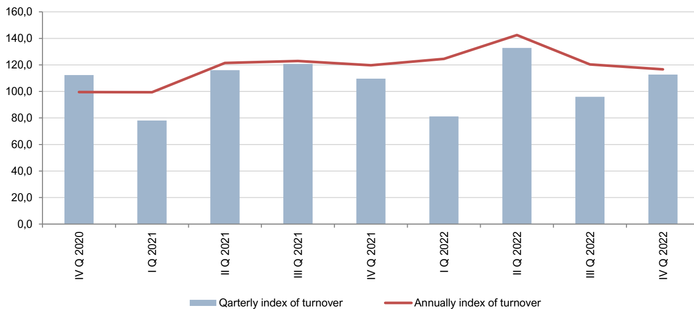
Graph 2. Quarterly and annually indices of industrial turnover

Industrial turnover index in Montenegro in IV quarter 2022 increased 16.6% compared to IV quarter 2021, while increased 12.7% compared to III quarter 2022.