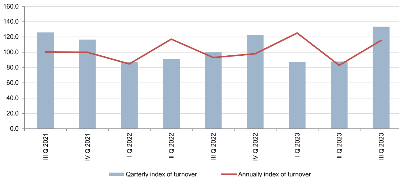
Graph 2. Quarterly and annually indices of industrial turnover

Industrial turnover index in Montenegro in III quarter 2023 increased 15.5% compared to III quarter 2022, while increased 33.5% compared to II quarter 2023.