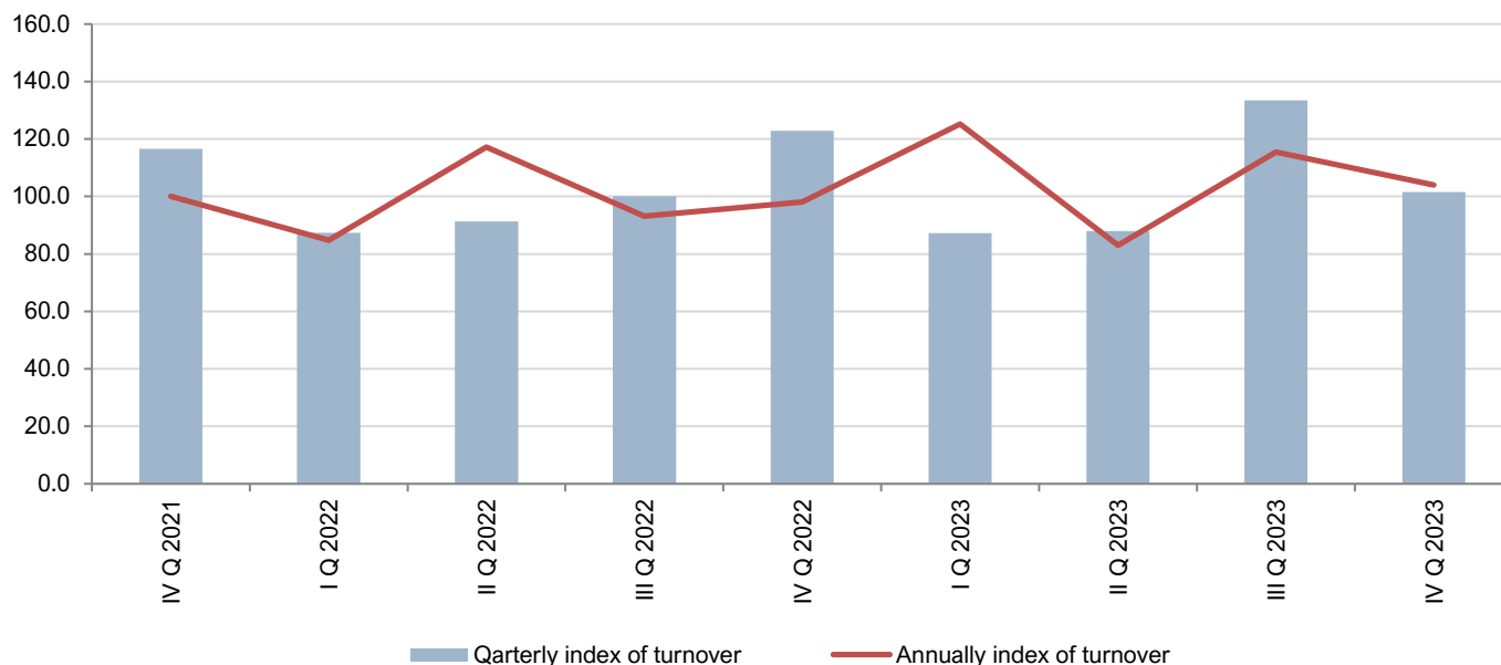
Graph 2. Quarterly and annual indices of industrial turnover

Industrial turnover index in Montenegro in IV quarter 2023 increased 4.0%, compared to IV quarter 2022, while increased 1.5% compared to III quarter 2023.