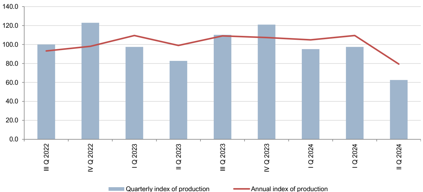
Graph 1. Quarterly and annual indices of industrial production

Industrial production in Montenegro in II quarter 2024, compared with I quarter 2024, decreased by 37.4%. At the sector level, compared to I quarter 2024, Mining and quarrying decreased by 31.9%, Manufacturing decreased by 11.7%, while the Electricity, gas, steam and air conditioning supply decreased by 64.4%.