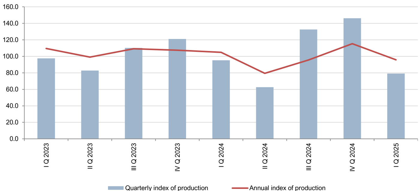
Graph 1. Quarterly and annual indices of industrial production

Industrial production in Montenegro in I quarter 2025, compared with IV quarter 2024, decreased by 20.9%. At the sector level, compared to IV quarter 2024, Mining and quarrying decreased by 5.2%, the Manufacturing decreased by 31.0% and the Electricity, gas, steam and air conditioning supply decreased by 9.0%.