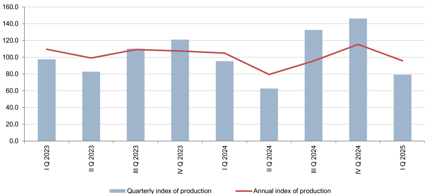
Graph 1. Quarterly and annual indices of industrial production

Industrial production in Montenegro in I quarter 2025 compared with IV quarter 2024 decreased by 20.9%. At the sector level, compared to IV quarter 2024, Mining and quarrying decreased by 5.2%, the Manufacturing decreased by 31.0% and the Electricity, gas, steam and air conditioning supply decreased by 9.0%.