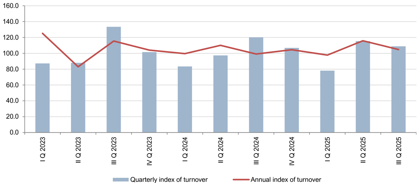
Graph 2. Quarterly and annual indices of industrial turnover

Industrial turnover index in Montenegro in III quarter 2025 increased 4.7% compared to III quarter 2024, and increased 8.8% compared to II quarter 2025.