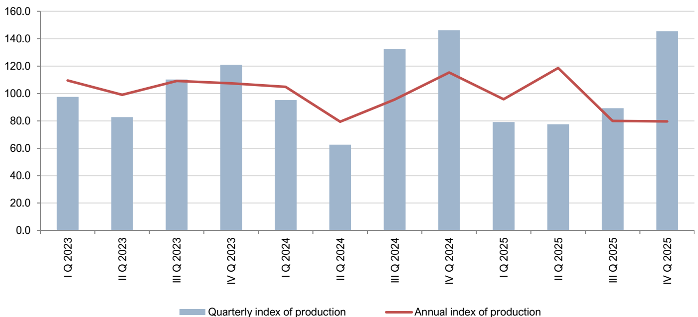
Graph 1. Quarterly and annual indices of industrial production

Industrial production in Montenegro in IV quarter 2025 compared with III quarter 2025 increased by 45.4%. At the sector level, compared to III quarter 2025, Mining and quarrying increased by 47.8%, the Manufacturing increased by 20.9% and the Electricity, gas, steam and air conditioning supply increased by 180.8%.