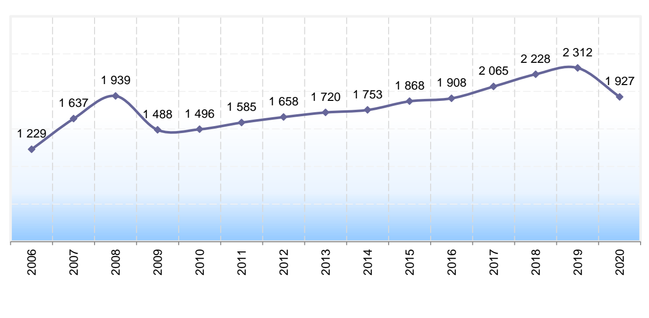
Graph 1. Trends in annual turnover in the wholesale trade, Montenegro, in thous.EUR1

Turnover in the wholesale trade in Montenegro in 2020 was 1 927 mill EUR, which represents an decrease of 16.7% compared to 2019. The largest share in total turnover trade have the groups in the field of nutrition which make 26.8% of total turnover in the wholesale trade.