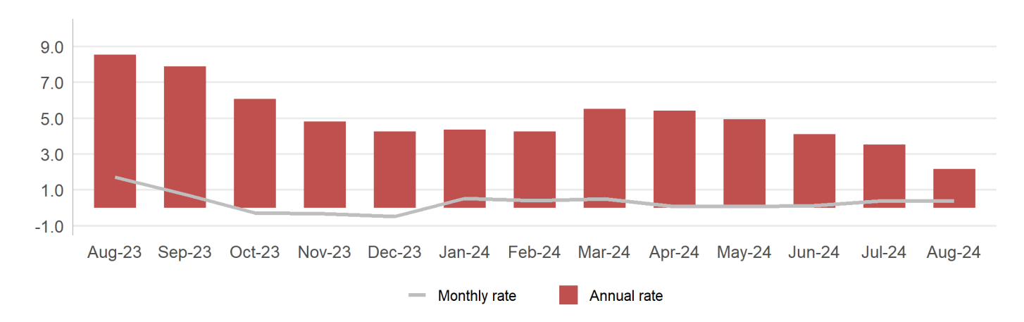
Graph 1. Annual and monthly rates of inflation (CPI), in %

Prices of other products and services mostly remained unchanged.