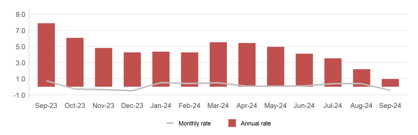
Graph 1. Annual and monthly rates of inflation (CPI), in %

Prices of other products and services mostly remained unchanged.