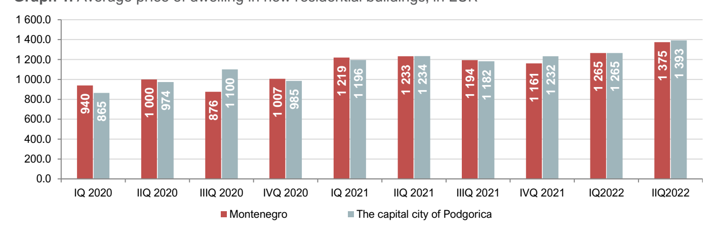
Graph 1. Average price of dwelling in new residential buildings, in EUR

In this release is shown the average price per the square meter of dwelling in a new residential building according to the following categories: enterprises (average market price) and solidarity housing development. The average price per square meter of dwellings in a new residential building in Montenegro in category enterprises in second quarter 2022 was 1 425 EUR, while in category solidarity housing development was 591 EUR.