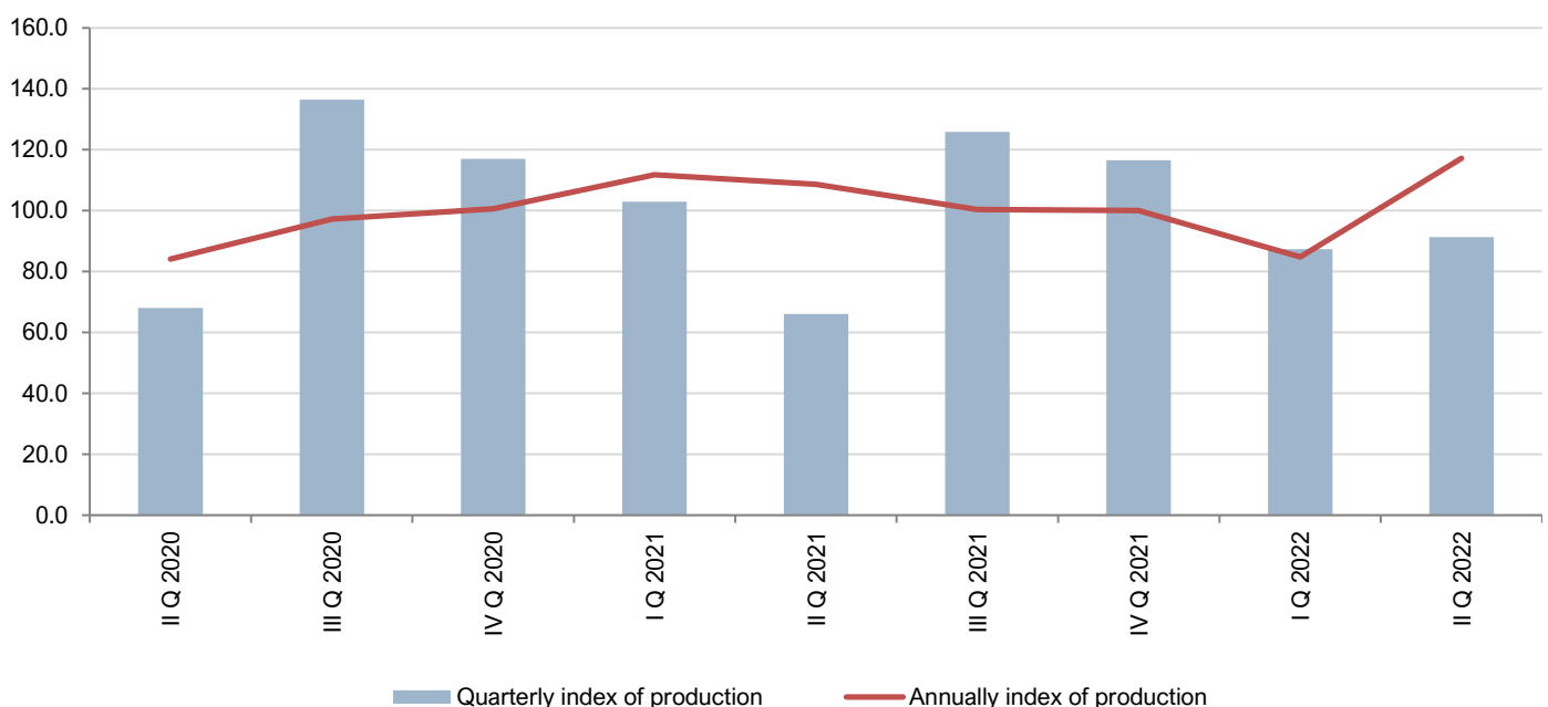
Graph 1. Quarterly and annually indices of industrial production

Industrial production in Montenegro in II quarter 2022 compared with I quarter 2022 decreased by 8.7%. At the sector level, compared to I quarter 2022, Mining and quarrying decreased by 32.3%, the Manufacturing increased by 29.5% and the Electricity, gas, steam and air conditioning supply decreased by 43.9%.