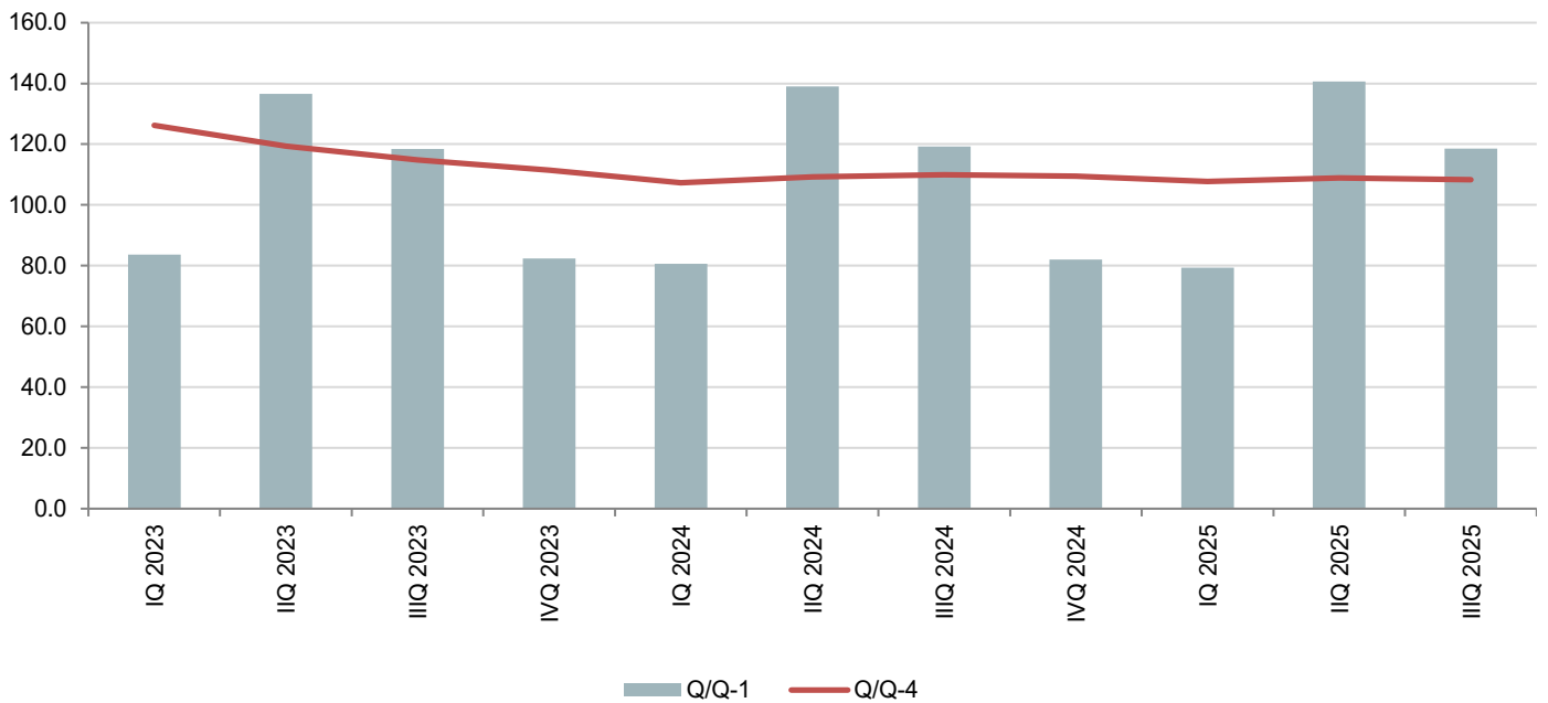
Graph 1. Turnover indices in services