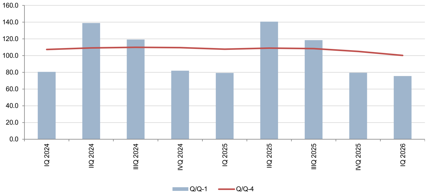
Graph 1. Turnover indices in services