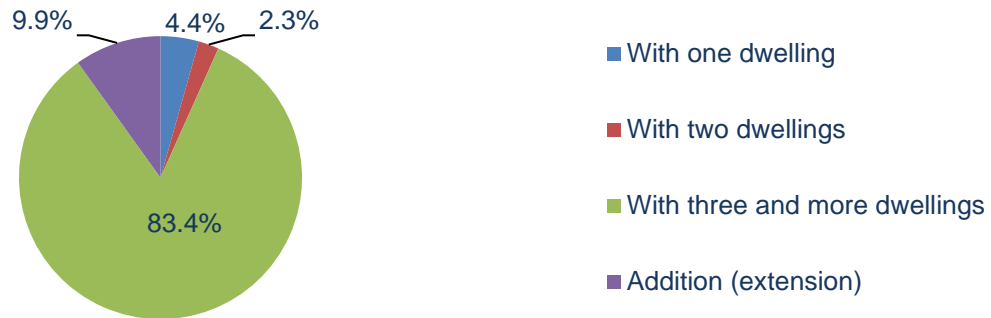
Graph 2. Structure of the number of dwellings and permits for notification of building work by types of constructions, Montenegro I quarter 2018